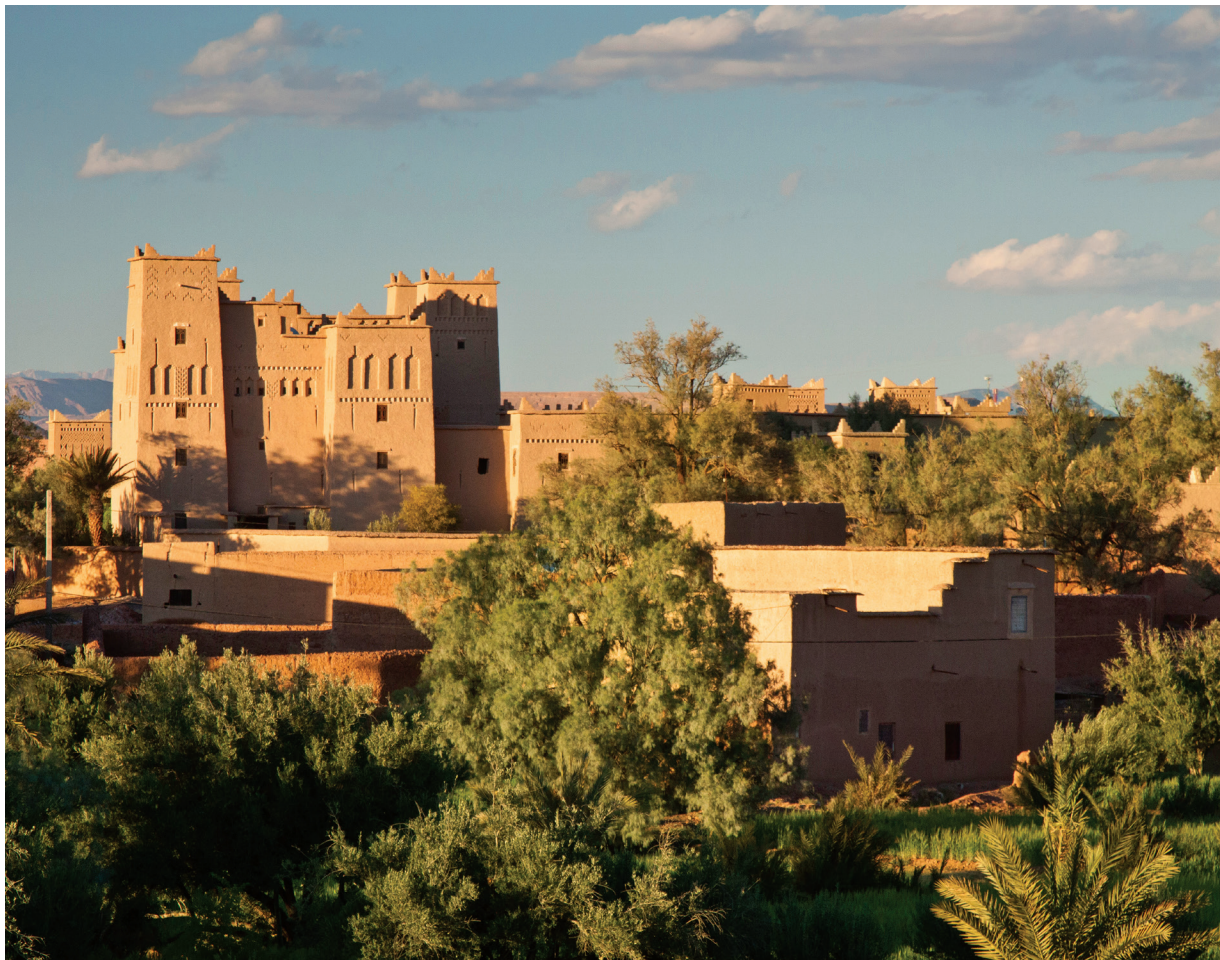
We encounter many of Morocco's age-old kasbahs on our journey.