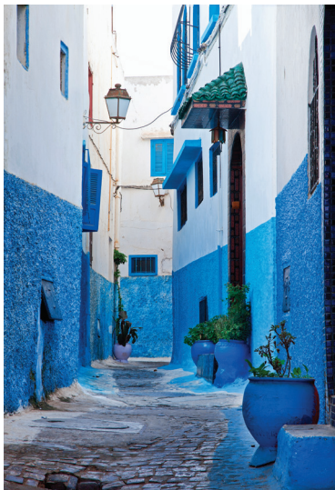
Rabat's Kasbah des Oudaias

Day 8: Erfoud/Rissani/Merzouga This morning we visit the city of Rissani, with its 18 th -century ksar , a virtually impenetrable warren of alleys. We enjoy a tour highlight this afternoon as we set out on a sunset excursion to the breathtakingly beautiful sand dunes at Merzouga on the edge of the Sahara. In the enormous silence we watch the sun set over the desert as we take a camel ride along the erg . Following this experience, we'll have dinner together in this desert setting before returning to our hotel tonight. B,L,D