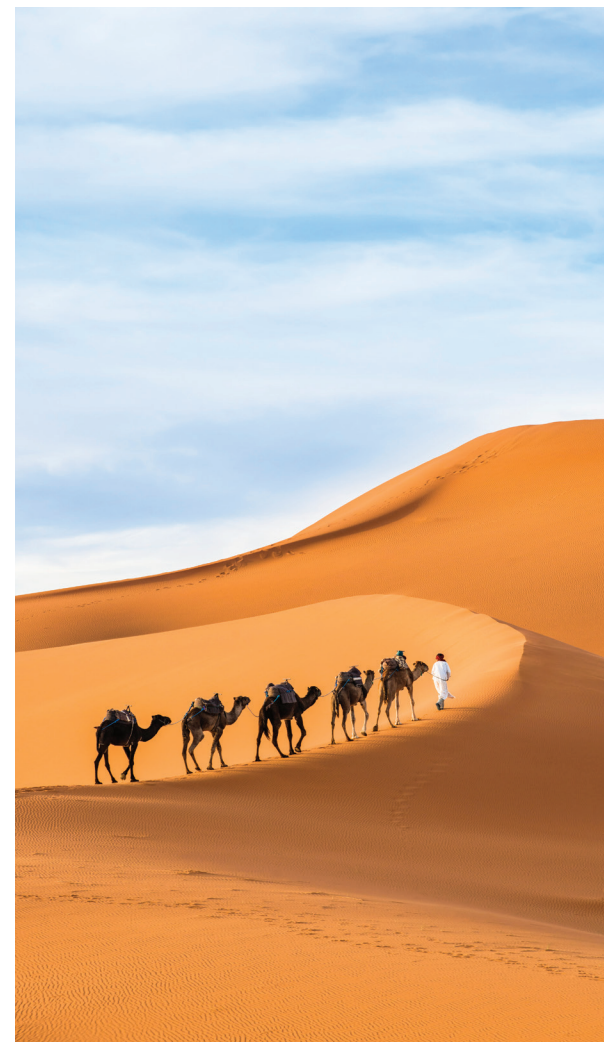
We ride camels in the Sahara on Day 8.