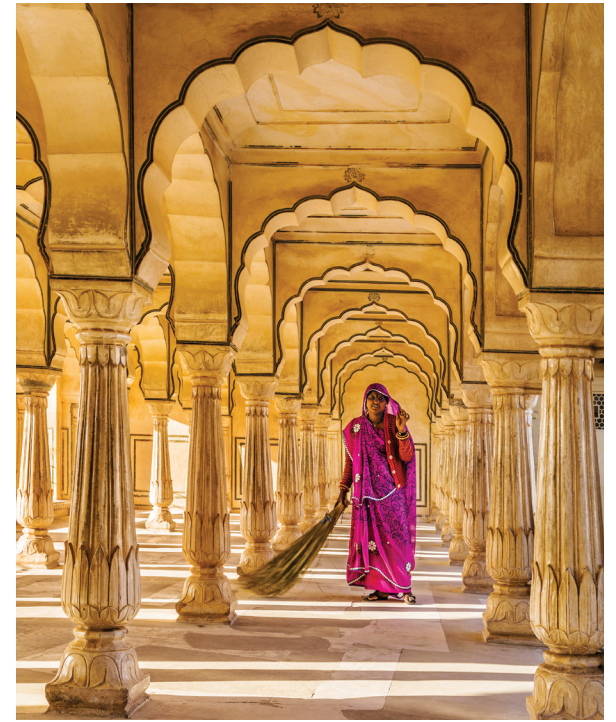
We explore Jaipur’s Amber Fort on Day 6.

Day 16: Varanasi/Delhi We fly this afternoon to Delhi, where the evening is at leisure. B