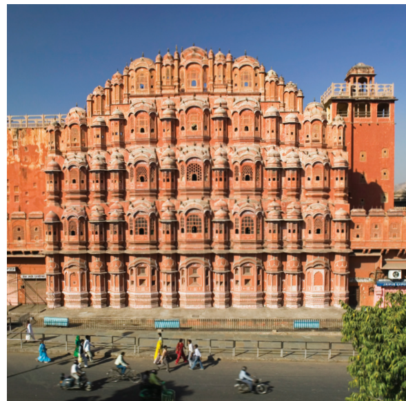
We see the “Palace of the Winds” in Jaipur on Day 6.

Day 15: Varanasi Early this morning we return to the Ganges where Hindu pilgrims perform their rituals along the ghats (steps) leading to the river. We visit several ghats by boat as we experience for ourselves the spiritual aura of the hallowed Ganges waters. Then we return to our hotel with time to rest before this afternoon’s walking tour and private performance of classical sitar. Tonight we celebrate our journey at a farewell dinner at our hotel. B,D