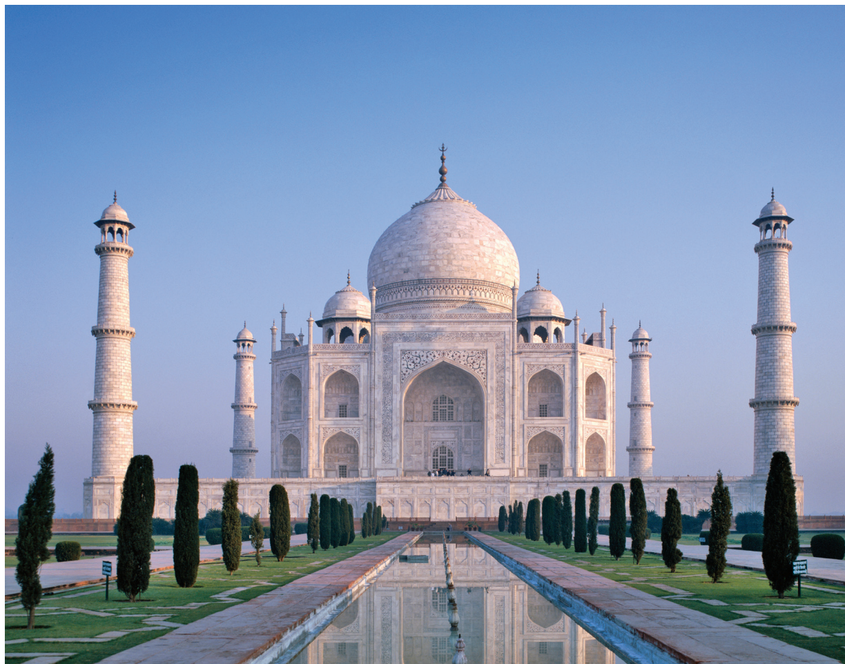
On Day 12 we visit the Taj Mahal, a UNESCO site considered one of the world's most beautiful buildings.