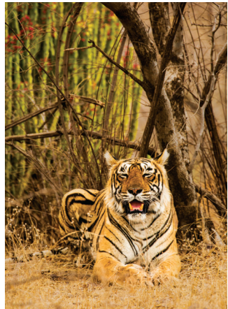
Bengal tiger rests in Ranthambore.

Day 11: Kalakho/Agra En route to Agra, we stop in the ancient village of Abhaneri to see the fortified Chand Baori step well (c. 800 CE), whose 3,500 steps descend some 13 stories into the ground. Continuing on, we reach the ancient Mughal stronghold of Agra,