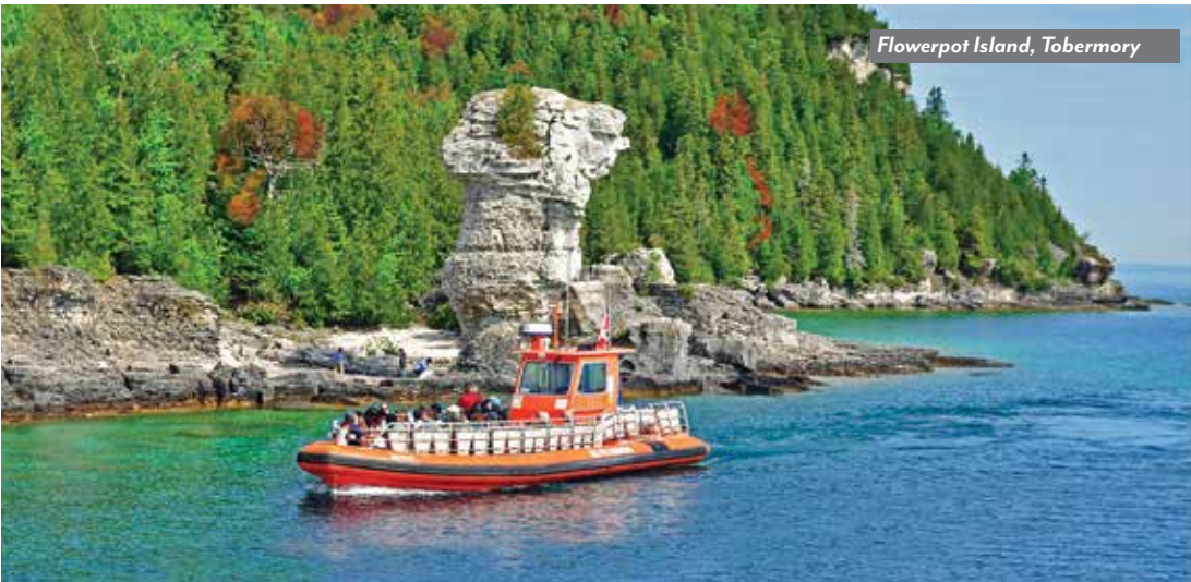
Flowerpot Island, Tobermory

Toronto, Canada/ Return to home city Day 8