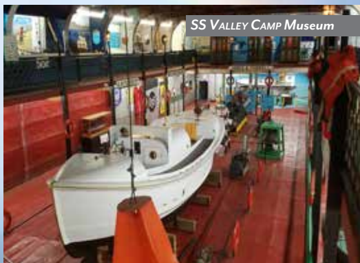
SS VALLEY CAMP Museum