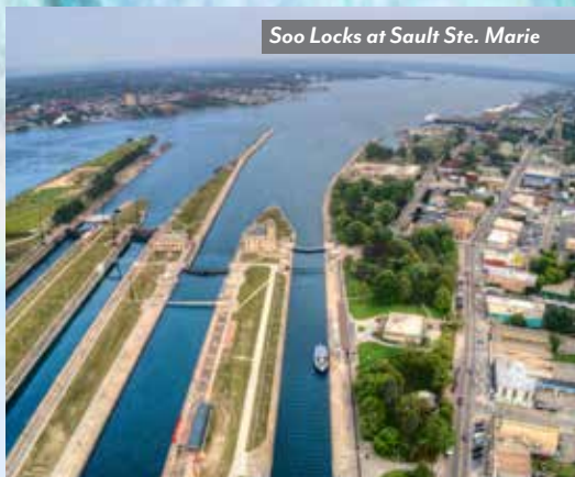
Soo Locks at Sault Ste. Marie

In the heart of North America lies the world's largest reservoir of fresh water, carved by glaciers 10,000 years ago. Surrounded by 11,000 miles of spectacularly sculpted shoreline, the five Great Lakes boast powerful natural wonders, historical maritime landmarks, and some of the greatest engineering feats of the 19 th century. Our tour offers a glimpse of life on the Great Lakes over the last two centuries as we visit the nearly 200-year-old Welland Canal that connects Lake Erie with Lake Ontario and the mighty Soo Locks—one located in Sault Ste. Marie in Ontario, Canada, and the other in a city by the same name in Michigan. Learn more about this fascinating maritime history at the SS VALLEY CAMP Museum, housed in a 1917 lake freighter, where two lifeboats from the famous EDMUND FITZGERALD shipwreck are on display.