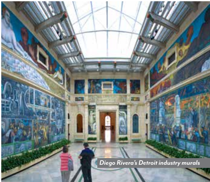
Diego Rivera's Detroit industry murals

Drive to Niagara Falls and ride the Hornblower Cruise