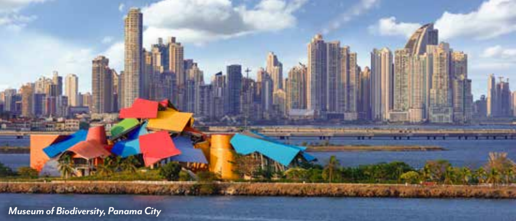
Museum of Biodiversity, Panama City