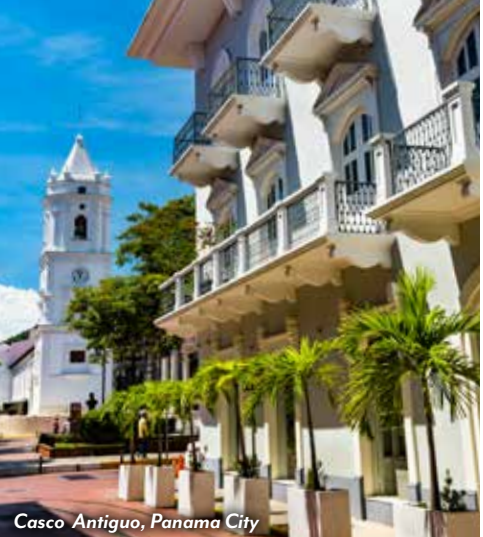
Casco Antiguo, Panama City