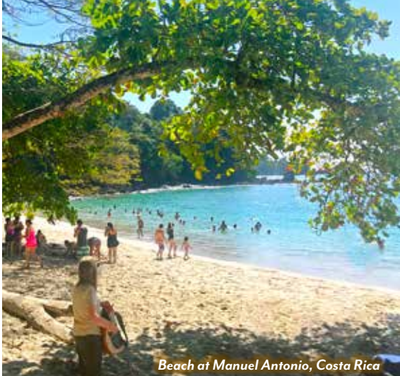
Beach at Manuel Antonio, Costa Rica

and three-toed sloths, and Capuchin monkeys. You'll also have the option to relax on the beach. (B,L,D)