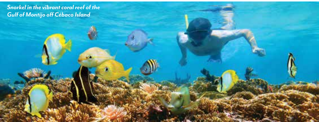
Snorkel in the vibrant coral reef of the Gulf of Montijo off Cébaco Island

Experience an unparalleled diversity of wildlife on a visit to the lush Manuel Antonio National Park—a captivating combination of rainforest, beach, and coral reef. It is home to more than 100 species of mammals, almost 200 species of birds, and various reptiles and amphibians. Naturalist guides will lead an exploration of this protected biodiverse paradise, where you may spot screeching howler monkeys, camouflaged iguanas, arboreal squirrel monkeys, two