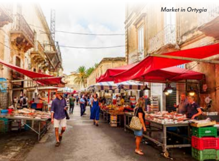
Market in Ortygia

Immerse yourself in Sicily's rich street food culture with savory snacks that can easily be enjoyed on their own. Starting in Palermo, panelle is one of the most established street market dishes, made from chickpea flour, water, salt, and sometimes parsley or other herbs. The mixture is fried into thin, crispy fritters that are often served on a roll or as a snack on their own. Deep-fried rice balls called arancini are filled with a variety of ingredients like meat, cheese, vegetables, and sometimes seafood. The rice is typically mixed with saffron and coated in breadcrumbs before being fried to perfection. For a fluffier alternative, crocchette are made of mashed potatoes, eggs, and cheese that are rolled into balls, breaded, and fried until crispy. These comfort food delights also can be filled with a variety of ingredients like ham, mushrooms, or spinach for added flavor. You would be remiss to pass up a taste of pani câ meusa, a signature Sicilian sandwich filled with chopped veal spleen—boiled in broth and seasoned with salt, lemon, and parsley—served on a sesame seed bun and optionally topped with ricotta or caciocavallo cheese. If you can't get enough of these delectable eats on the streets of Palermo, you also can stave off hunger with these Sicilian staples while exploring Ortygia's markets.