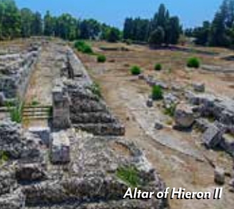
Altar of Hieron II

Centuries-old ruins beckon you to step into mythical pasts as sparkling turquoise waters ensconce pastel-hued towns and villages on this extraordinary itinerary. Each destination in Italy, Sicily, Malta, Tunisia, and Carthage reveals an intriguing history and distinct character—luring explorers, artists, architects, and powerful rulers for generations. The world's greatest empires are etched into every incomparable landscape and architectural triumph. It is a rare opportunity to see the diverse cultural legacies of the Italians, Greeks, Goths, Moors, Normans, Castilians, Turks, Jesuits, Spanish, and French come to life among timelessly spectacular scenery.