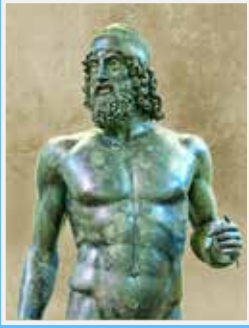
A Riace Bronze Statue