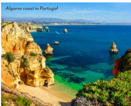
Algarve coast in Portugal

After enjoying breakfast on the ship, disembark and transfer to the airport for your return flight home or continue on to the Barcelona Post-Program. (B)