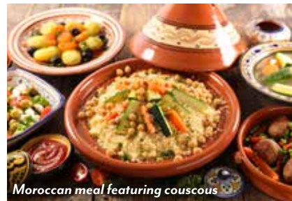
Moroccan meal featuring couscous