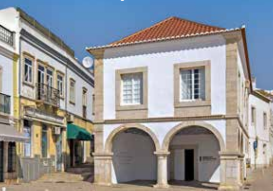
Slave Market Museum, Lagos