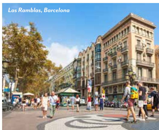
Las Ramblas, Barcelona