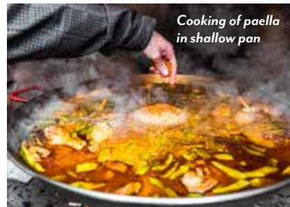
Cooking of paella in shallow pan

The Iberian Peninsula has a rich culinary history that has changed the face of global cuisine, most remarkably with dishes featuring bold flavors and spices. One of the most famous foods hailing primarily from Valencia, Spain, is paella —a flavorful rice dish traditionally made with olive oil, chicken broth, vegetables, and a variety of meats and seafood. The dish got its name from the traditional wide, shallow pan used to cook it, with paella literally meaning “frying pan” in Valencian Spanish. The signature yellow color of the dish traditionally comes from saffron, but turmeric and calendula can be used as substitutes. Paella had humble beginnings, originally being considered a lunchtime meal for farmers and laborers and made with whatever was on hand at that time. Another popular dish native to the region is couscous , which has roots in Morocco and is prepared from ground wheat rolled into pellets. Experience these savory cultural staples firsthand on our tour with a cooking presentation and lunch in Tangier, Morocco, and a trip to the market with a local chef in Valencia, followed by a paella cooking demonstration.