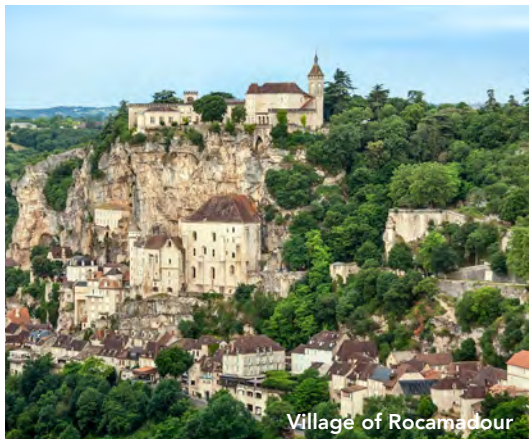
Village of Rocamadour

Activity Level: Activities are generally not very strenuous, however, we expect that guests can enjoy two hours or more of walking each day, are sure-footed on cobbled and unpaved surfaces, and can walk up and down stairs without assistance. The Château de Mercuès was constructed in the 13th century. While it has been updated to modern standards, its original structure means guests will find stone floors and steps that may not have railings. There is an elevator, but it does not access every floor.