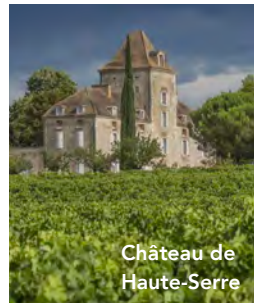
Château de Haute-Serre