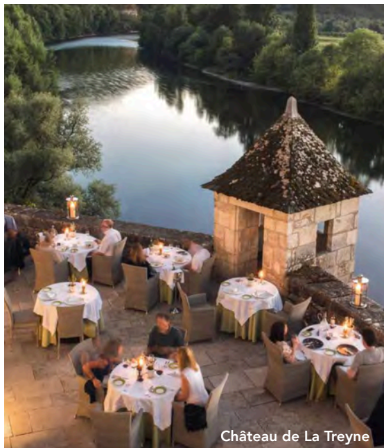
Château de La Treyne