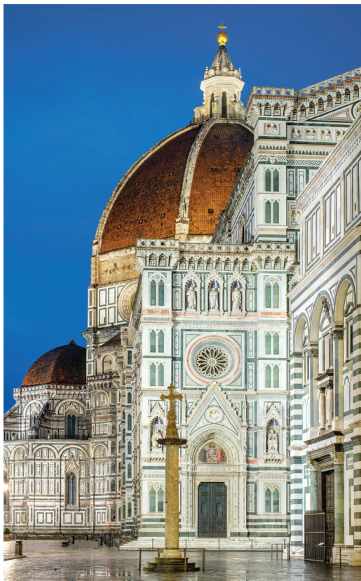
Florence’s Duomo and Baptistry