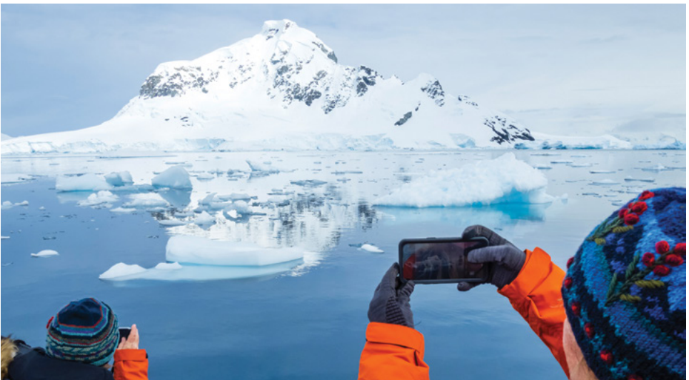
Guests photographing from a Zodiac in Paradise Harbor, Antarctica.

On a Lindblad Expeditions voyage, photography is never an afterthought—it's central to the expedition experience. A photography expert and a certified photo instructor (CPI) join each voyage to assist travelers with everything from camera settings to composition. Every guest—from smartphone camera users to advanced hobbyists—can stand side by side with top photographers, pick up tips in the field, and return home with the photos of a lifetime. With the complimentary OM System Photo Gear Locker, you can field test new lenses, camera bodies, and more.