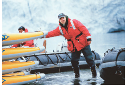
The expedition staff helps guests board kayaks safely and swiftly.

Many are veteran polar guides who have worked with us for decades, chosen for their extensive knowledge of subjects like geology, wildlife biology, and climate science. They, along with the guest speakers who join us on board, give rich context to the wildlife and landscapes we encounter ashore.