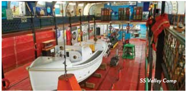
SS Valley Camp

In the heart of North America lies the world's largest reservoir of fresh water, carved by glaciers 10,000 years ago. Surrounded by 11,000 miles of spectacularly sculpted shoreline, the five Great Lakes boast powerful natural wonders, historical maritime landmarks and some of the greatest engineering feats of the 19th century. Our tour offers a glimpse of life on the Great Lakes over the last two centuries as we