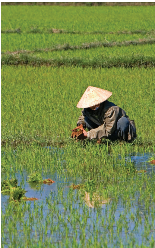
A local farmer tends a rice paddy.

Day 15: Depart for U.S. Today we transfer to the airport for our return flights to the U.S. B