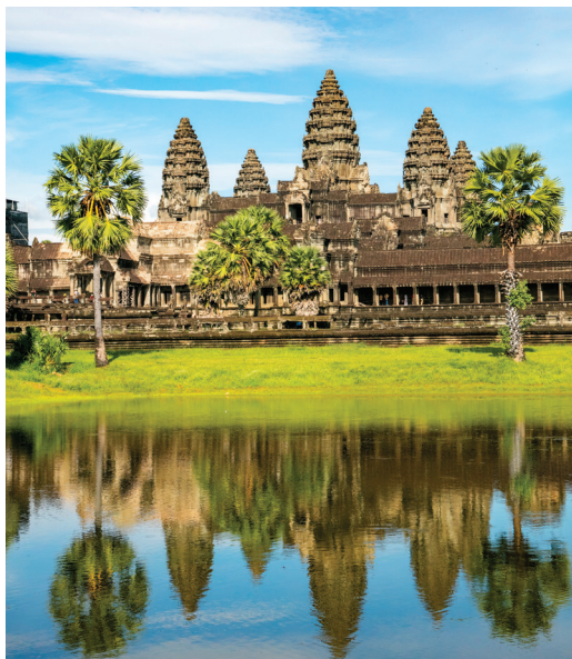
Angkor Wat (post-tour extension)