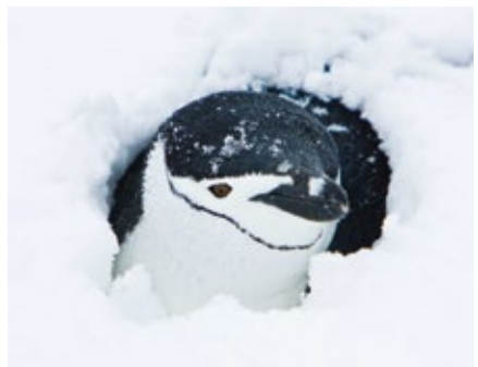
A chinstrap penguin burrowed in the snow.

This morning, the ship will be moored off of King George Island once again. Following disembarkation and Zodiac rides to shore, the flight departs the White Continent and returns to Puerto Natales for an overnight stay. (B,L,D)