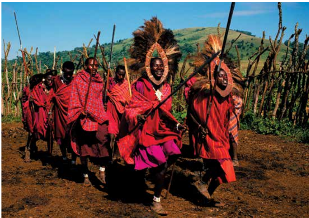
We visit a Maasai village to learn about their culture.

Day 8: Ngorongoro Crater On our morning tour of the 100-square-mile crater, we have our only chance to see all of Africa’s “Big Five” – elephant, buffalo, rhino, lion, and leopard – in one place. B,L,D