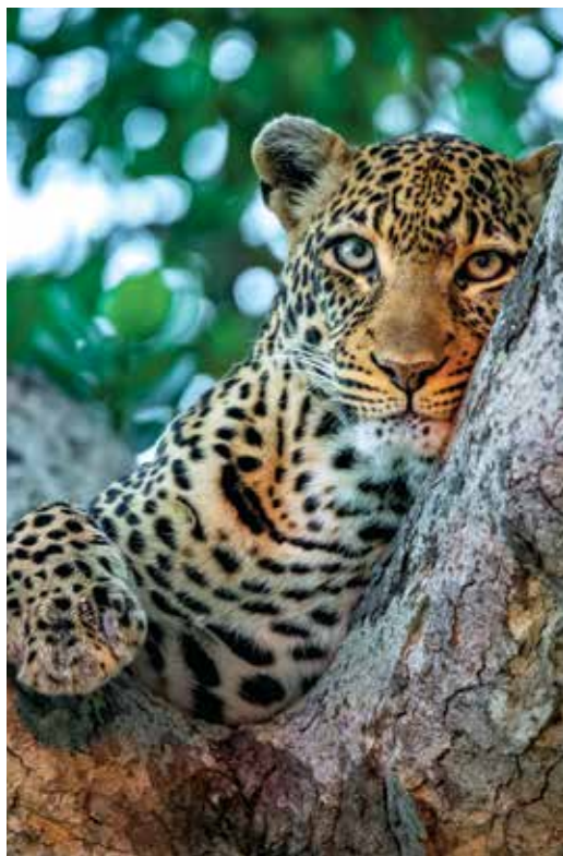
Leopard in the Serengeti

Day 16: Arrive U.S. We reach the U.S. today and connect with our flights home.