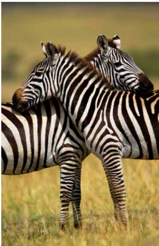
We're sure to see zebras.