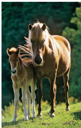
We may see wild horses while on our tour.

rift valley. Revered for its historical importance – this is where Iceland’s Althing, or national assembly, met in open-air sessions from 930 CE to 1798 – Thingvellir also sits on an active volcanic site at the spot where the fissure between the geological plates of North America and Europe is most evident in Iceland. It’s also a gem of nature, with canyons, caves, waterfalls, and ponds surrounded by snowcapped mountains. We learn about the historic parliament founded here in 930 CE, and walk along a gorge into the rift valley itself. Following our visit here, we head to a local farm for lunch, then depart for famed Great Geysir and Gullfoss, Iceland’s immensely popular “golden” waterfall. We continue on to Reykjavik, home to more than half of the nation’s population and ranking as one