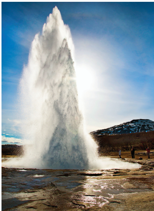
Iceland’s hot spring geysers are natural attractions.

Those who wish can join in an optional tour to the Sky Lagoon. Tonight, we celebrate our adventure over a farewell dinner. B,D