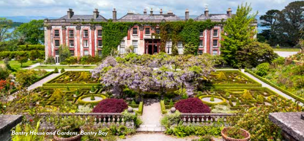
Bantry House and Gardens, Bantry Bay