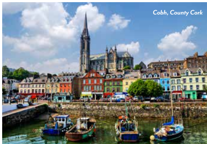
Cobh, County Cork

In Galway, select from two included excursions. On the first choice, admire the Wild Atlantic Way's dramatic splendor at the Cliffs of Moher and The Burren. Enjoy a guided walk across The Burren's karstic landscape and watch waves crash below you from breathtaking cliffs 700 feet above the ocean. Your other option takes you through brooding scenery of rugged mountains and windswept bogs as you explore some of