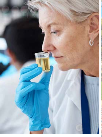
Create your own perfume in Grasse, France

your own plans for lunch. This afternoon, embark the deluxe Sea Cloud Spirit , a unique, luxurious tall ship.