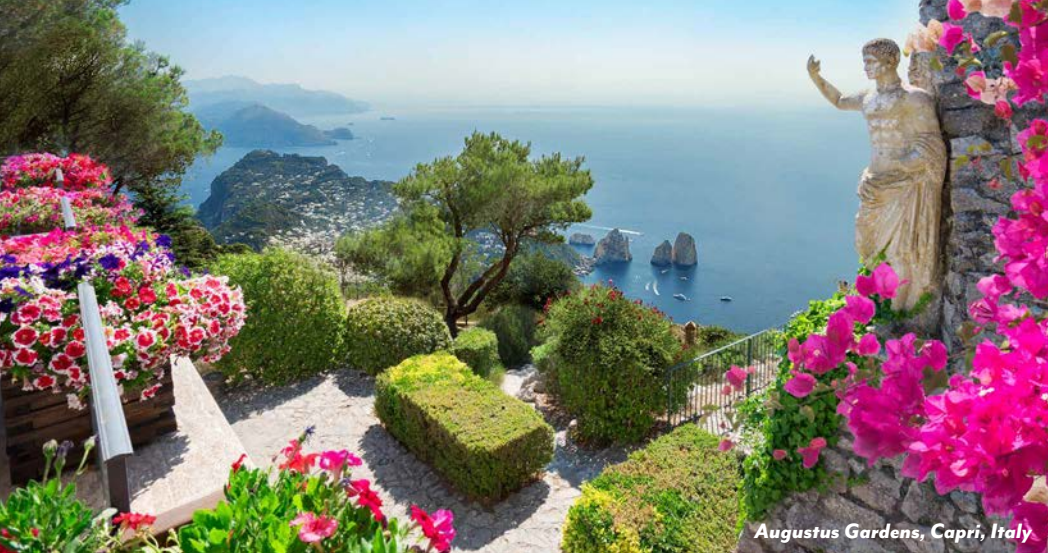
Augustus Gardens, Capri, Italy

Phoenician traders in the eighth century B.C. Visit Palermo's baroque square and the 12th-century Palermo Cathedral. Explore the sights and smells of revered Palermo street food at the Capo market and browse buzzing food stalls. After a lunch of popular local foods, enjoy your Traveler's Choice excursion. Select to visit the lauded Cathedral of Monreale, known for its Byzantine mosaics, or encounter the infinite beauty inside the historic Royal Palace and step inside the Palatine Chapel, a 12th-century masterpiece that reflects Sicily's diverse