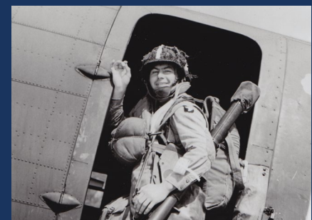
Paratrooper of the 101st Airborne Division prior to D-Day