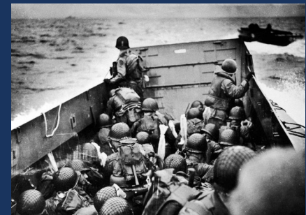
D-Day Landings on Omaha Beach