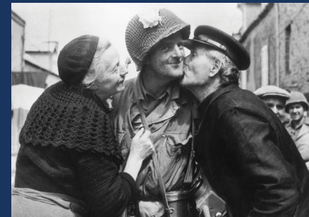
An American soldier is given a warm welcome after the town of Saint-Sauveur-le-Vicomte was liberated.

NOW ACCEPTING BOOKINGS Let us help you plan your journey into history by contacting us at 877-813-3329 X 257.